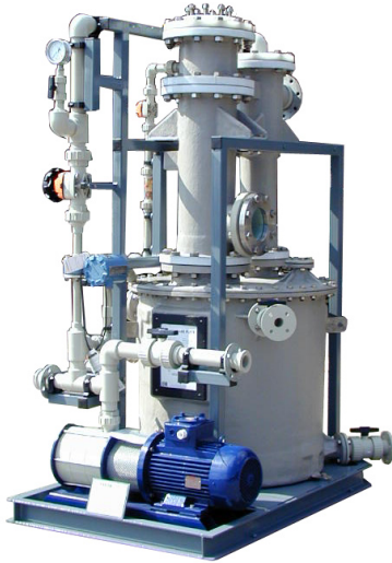
Jet Tower System

Transvac are specialist suppliers of custom designed air pollution control systems covering a number of technologies. We offer a complete service including initial site investigation (to determine the best process solution), project management, supply of equipment and final commissioning.