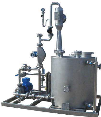
Jet Scrubber System