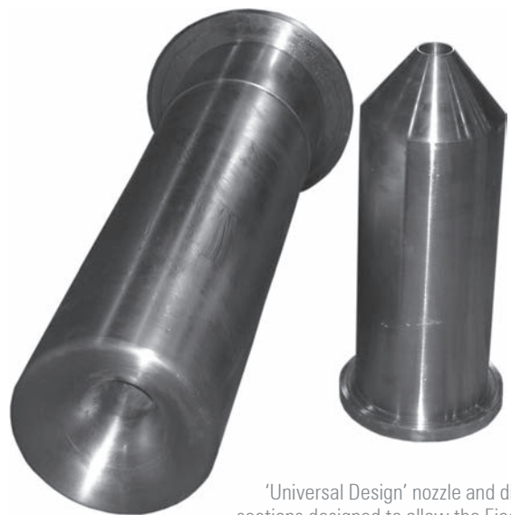
'Universal Design' nozzle and diffuser sections designed to allow the Ejector to operate at new production conditions

By changing-out the internals at recommended intervals, high performance efficiency can be maintained over the lifetime of the unit, thereby maximising gas recovery.